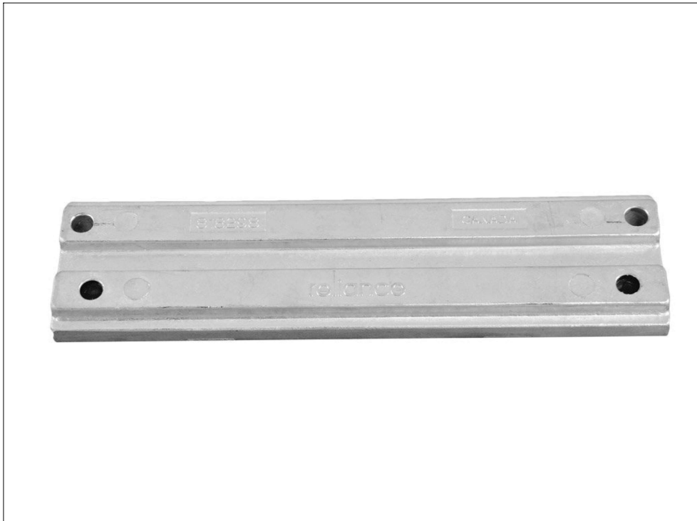
Outboard Plate Anode

This drawing is the property of Cathodic Anodes Australasia. To be used with permission only. This drawing becomes an uncontrolled document once issued as hard or electronic copy. Customer to confirm current revision of drawing prior to ordering.