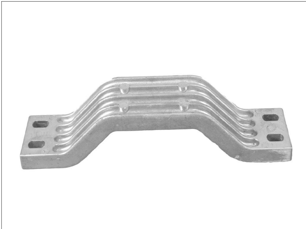
Bracket Anode To Suit 150,200,250 & 300 HP Outboards

This drawing is the property of Cathodic Anodes Australasia. To be used with permission only. This drawing becomes an uncontrolled document once issued as hard or electronic copy. Customer to confirm current revision of drawing prior to ordering.