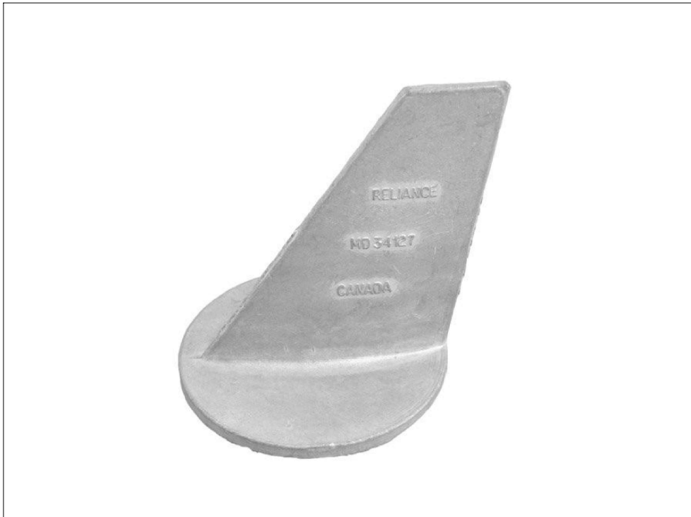
Trim Tab Aluminium Anode - Long Leg

This drawing is the property of Cathodic Anodes Australasia. To be used with permission only. This drawing becomes an uncontrolled document once issued as hard or electronic copy. Customer to confirm current revision of drawing prior to ordering.