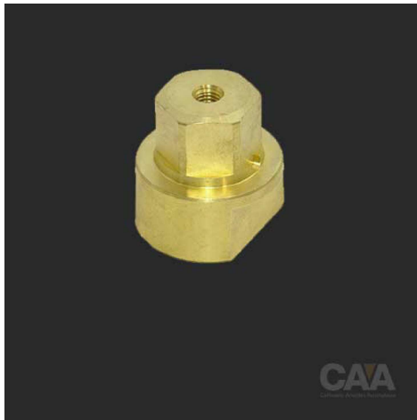
Bronze (DR Brass) Insert