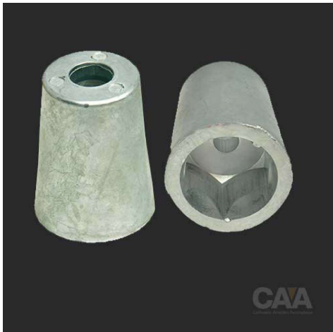
Zinc Anode Only

This drawing is the property of Cathodic Anodes Australasia. To be used with permission only. This drawing becomes an uncontrolled document once issued as hard or electronic copy. Customer to confirm current revision of drawing prior to ordering.