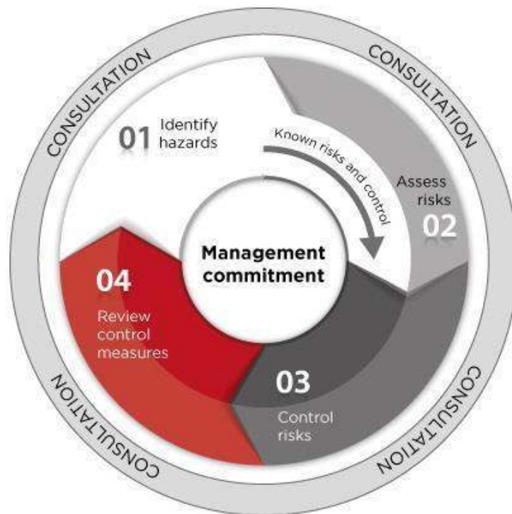
Figure 1 The risk management process

The process of managing risk described in this Code will help you decide what is reasonably practicable in particular situations so that you can meet your duty of care under the WHS laws.